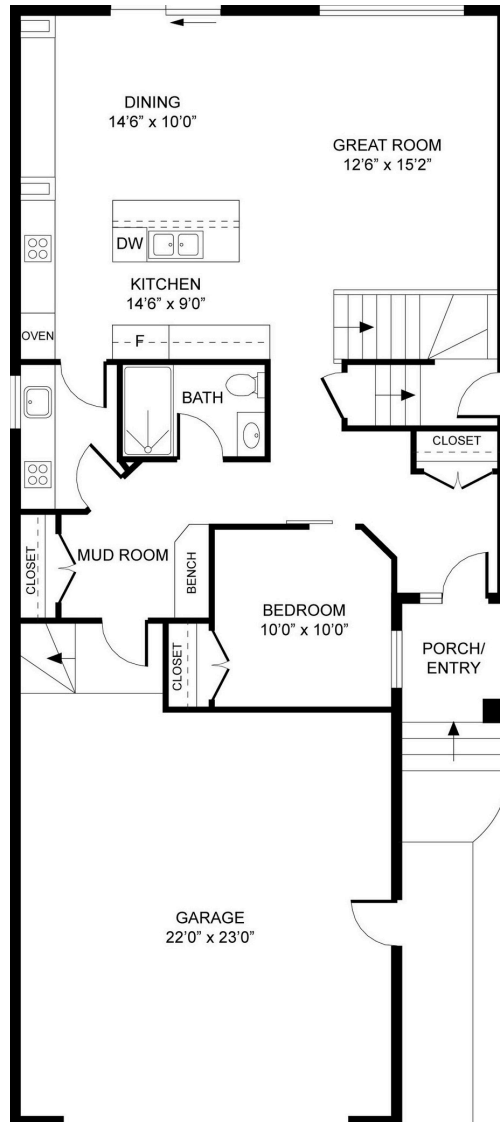
Main Floor - 1024 SQ.FT